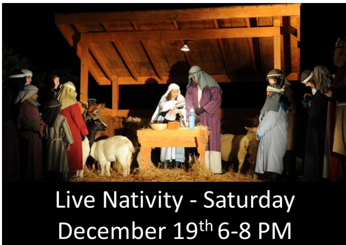
Live Nativity - Saturday December 19 th 6-8 PM