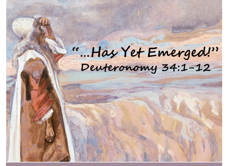
October 25 — 21<sup>st</sup> Sunday after Pentecost Sermon Title: "...Has Yet Emerged!" Scripture: Deuteronomy 34:1-12

Sadly, I had to return to Augusta this week to a funeral for a friend. She was my volunteer assistant for worship and the church music library. Her husband was buried in the church cemetery and she would point out the headstone and remind me that she would be buried right next to him and I was going to do the funeral service. (BTW – that was NOT a request – it was an expectation!